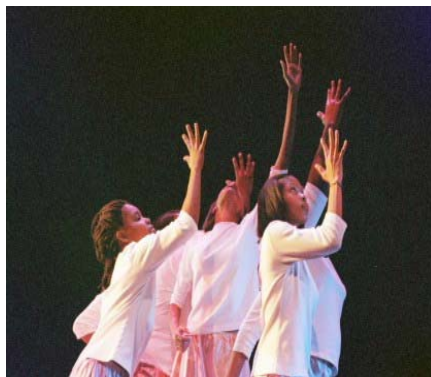
Alpha Nu Omega: Ohio State University Gospelrama 2004

Gospelrama 2004: Visit periodically for updated information on Gospelrama 2004. This is an event you won't want to miss.