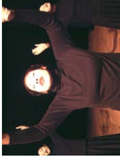
Crystal Gordon Heritage Hall, Fall 2001

In the Old Testament, Ezekiel was a prophet that was called to announce God's judgment on Israel, and other nations, and to proclaim restoration for God's people. His preaching was not well received by the Jews who were