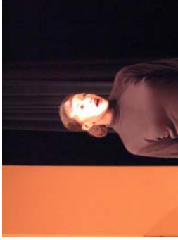
Segayle Walford Heritage Hall, Fall 2001

is to minister to various ages by praise and magnification to the Lord our God, utilizing our whole bodies with physical interpretation and movements to songs, dramatic skits, and intense facial expressions.