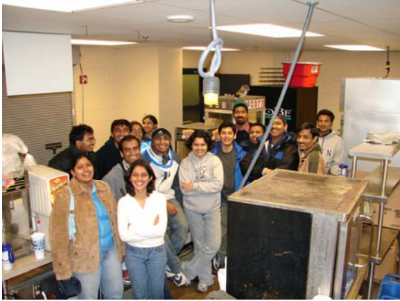
Wisconsin vs. PSU game

This is what the volunteers had to say after the first game