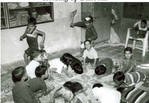
Playing a game