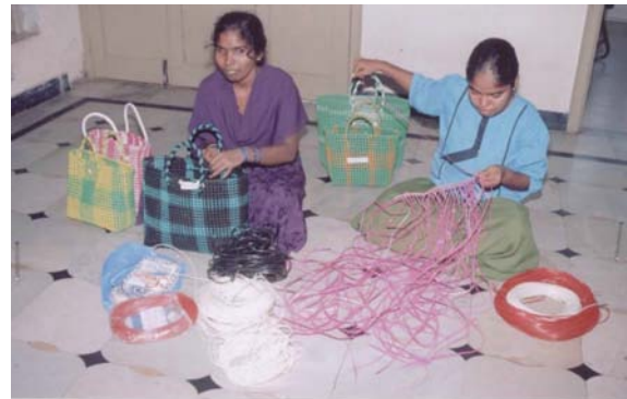
Prerana women in Basket making-Bringing Colors to shopping bag!