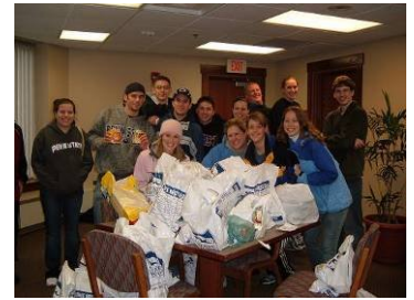
Some of the Mu Pi brothers collecting food for the Second Harvest Food Bank.

raised money for the blind, to train seeing eye dogs. Finally, we went door to door collecting food for the Second Harvest Food Bank. Next semester looks to be just as busy.