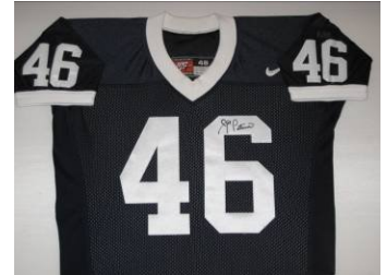
Jersey signed by Joe Paterno